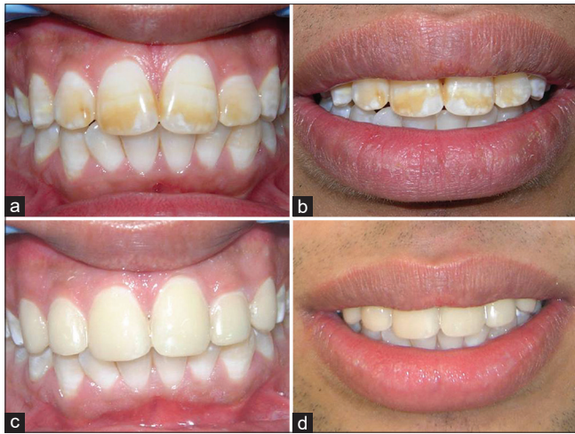
Figure 5: Group B – patient rehabilitation with direct composite veneers. (a) Preoperative intraoral labial view. (b) Preoperative extraoral labial view. (c) Postoperative intraoral labial view. (d) Postoperative extraoral labial view

veneer preparation. [4,5] Etchant Gel S (phosphoric acid 35%) was applied to prepared tooth surface for 30–60 s, followed by water spray for 20 s. Excess water was removed with oil-free air. Interdental matrices were placed and “One Coat Bond SL” (single-component bonding agent) was applied to the prepared tooth, left for 20 s, blow dried with oil-free air, and light cured for 30 s. The same was applied on the contact side of the componeer also, left for 20 s, and blow dried with oil-free air but not light cured (to ensure wettability). The selected composite resin shade was applied with the “MB5” modeling instrument to the contact side of the componeer and to the tooth to prevent air inclusions. Componeer was positioned on the tooth under gentle pressure using a placer instrument. Excess material and interdental matrices were removed and light curing done for 40 s on palatal and facial aspects, respectively. Margins were trimmed with flame-shaped diamond points. Finishing and polishing strips were used for the proximal regions, flexible discs for incisal angles, and silicone rubber polishers for obtaining high gloss. Cervical margins were thoroughly polished to prevent plaque accumulation.