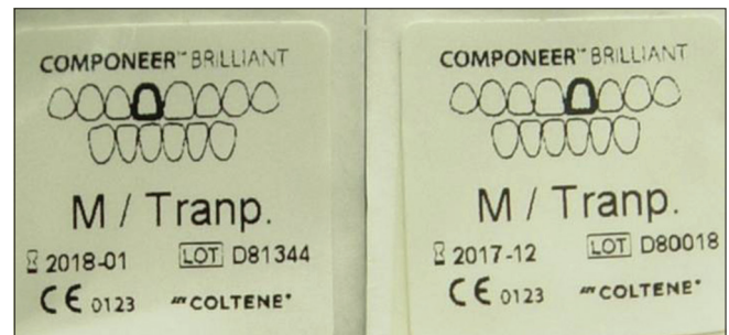
Figure 2: Componeer blister packs depicting the tooth number, size, and shade

Tooth preparation was minimally invasive for both the groups and in accordance with prescribed guidelines for