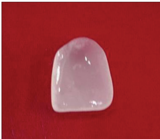
Figure 1: Nano-hybrid componeer shells

Veneering was kept supragingival for both the groups. The shape, size, and shade of the componeers were customized using a contour guide, so as to match the contour and size of patient's existing teeth and cosmetic requirements. The contour guides were available in 36 different shapes and small, medium, large, and extra large sizes. The assessment was done by placing the contour guide over the tooth to be restored and assessing the mesiodistal and incisocervical fit [Figure 3]. The color of the guide was transparent blue, which enabled optimum contrast on the tooth. Facial aspect of componeers, being extremely thin (0.3 mm), was not altered. Only their proximal and cervical margins were minimally trimmed to custom fit the proximal and cervical aspects of the prepared tooth surface. The clinical performance of componeers in Group A and direct composite veneers in Group B was evaluated and compared for the aforementioned parameters at 0- (immediately post veneering) 3-, 6-, 9-, and 12-month interval. Figure 4a-d depicts a "Group A" case rehabilitated with componeers.