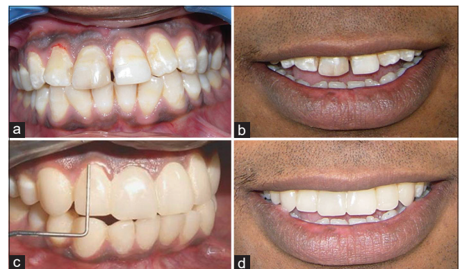
Figure 4: Group A – rehabilitation with componeers. (a) Preoperative intraoral labial view. (b) Preoperative extraoral labial view. (c) Postoperative clinical evaluation. (d) Postoperative extraoral labial view