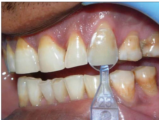
Figure 3: Assessment of mesiodistal and incisocervical fit of the componeer using the componeer contour guide

Figure 5a-d depicts a "Group B" case rehabilitated with direct composite veneers.